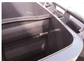
Split bin with partition wall