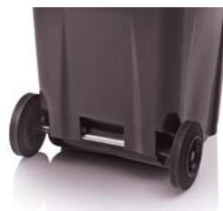
Wheels Ø 250 mm