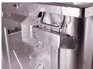
Reinforced receptacle pins