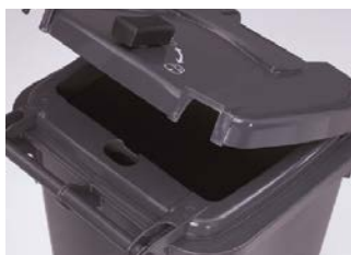
Lid, openable from both sides