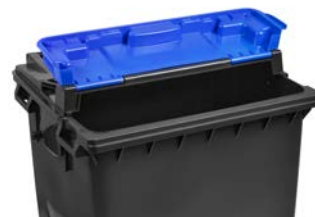
Lid in lid